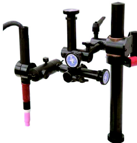
3-Axis Micro Torch Positioner with magnetic stop